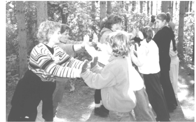
Outdoor initiative activities help mothers and daughters see each other in new ways!