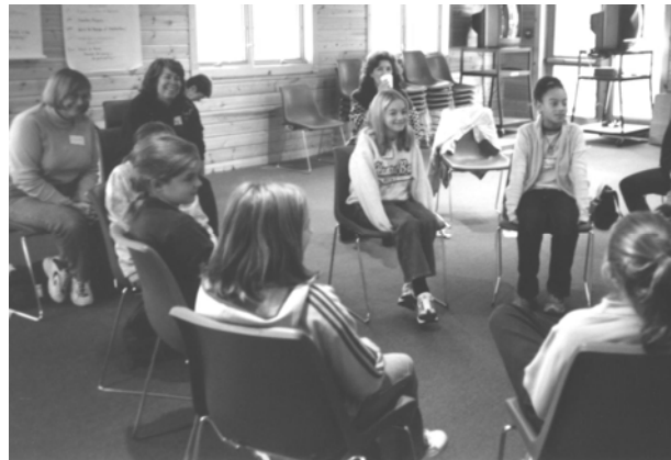
Mothers and daughters have fun while learning about each other during the fishbowl activity.

“Learning about periods was the most helpful part of the day. Now I don’t feel so uncomfortable talking about puberty.”