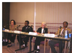
Panelists from a 2004 conference

Minnesota Church Center Assembly Rooms 1 & 2 122 West Franklin Avenue Minneapolis, MN 55404